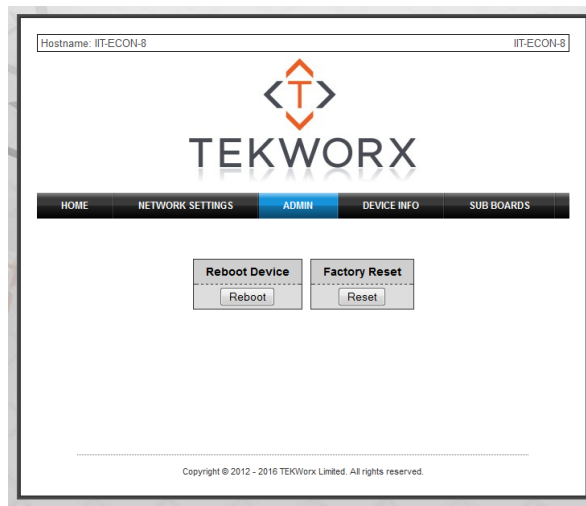
Figure 3 - Admin

The admin page allows you to perform administration functions with the device. All options have a confirmation before performing the selected operation.