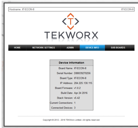
Figure 4 - Device Info

The device information page will show information about the device and its current state.